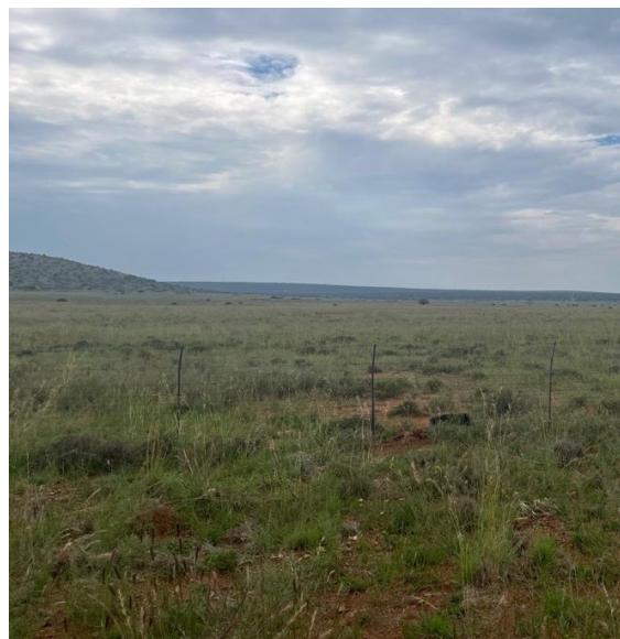
Section of the project site

Gaining clarity on options for grid connection and transport are particularly important for any existing or future PtX projects in the region to design the optimal project configuration and suitable PtX product choice. Enertrag's Taaibosch project is currently permitted for the production of e-ammonia and further derivative choices remain options to be explored.