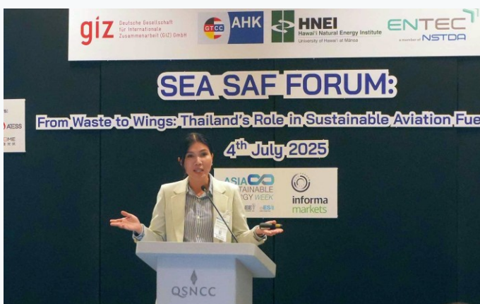
Speaker at the SEA SAF Forum.

In H2Uppp organised a forum delving into SAF prospects in Thailand and Southeast Asia at the Asia Sustainable Energy Week 2025. The forum noted that while countries like Thailand have abundant feedstocks, exploring alternatives such as biomass-to-fuels is key to ensuring sustainability. With existing technologies and policies supporting SAF, the main challenge is aligning implementation with transport sector decarbonisation goals. Read on.