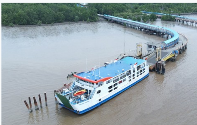
A conventional ferry docking at Air Putih Harbour in Indonesia.

In a new PPP with compressor manufacturer Neumann & Esser and French hydrogen infrastructure developer HDF Energy, H2Uppp will be assessing the feasibility of operating hybrid hydrogen and battery-powered ferry systems in Indonesia. Inter-island maritime transport is an essential backbone for economic and social activities in the archipelagic nation. Today, many existing ferry operations rely on fossil fuels and are constrained by isolated energy grids.