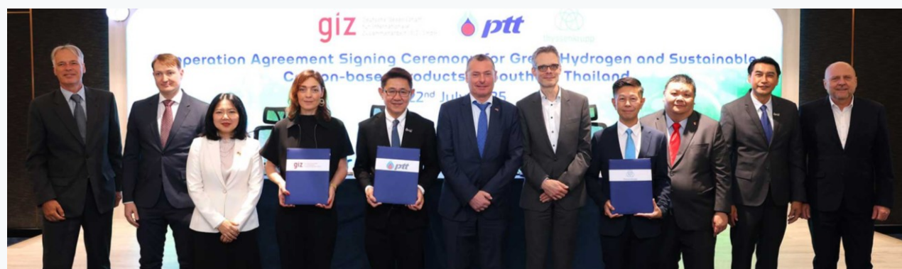
Representatives from H2Uppp, PTT and Thyssenkrupp Uhde signed a cooperation agreement in Bangkok.

The German industrial plant engineering firm Thyssenkrupp Uhde and the Thai gas processing company PTT have launched a project to stimulate the green hydrogen and PtX market in Thailand. The initiative will focus on southern Thailand, and explore the production of green hydrogen, e-methanol, e-ammonia, urea and sustainable aviation fuel (SAF) alongside existing PTT infrastructure. The project will provide a blueprint for large-scale production and commercialisation. Thyssenkrupp Uhde (Thailand) will contribute its expertise in chemical processes. PTT aims to reach net zero emissions by 2050. H2Uppp serves as the public partner in this PPP cooperation.