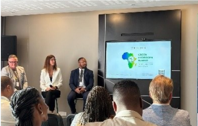
Addressing early-stage challenges in PtX projects at the African Green Hydrogen Summit.

At the 2025 African Green Hydrogen Summit in Cape Town, H2Uppp hosted a session on early-stage challenges in Power-to-X (PtX) projects. Speakers from GeFP and Enertrag highlighted key hurdles – from biogenic carbon sourcing and hybrid fuel regulation to grid connectivity in remote areas like South Africa's Northern Cape. H2Uppp emphasised the role of PPPs in de-risking early-stage activities and enabling scalable, replicable models for Africa's green hydrogen future.